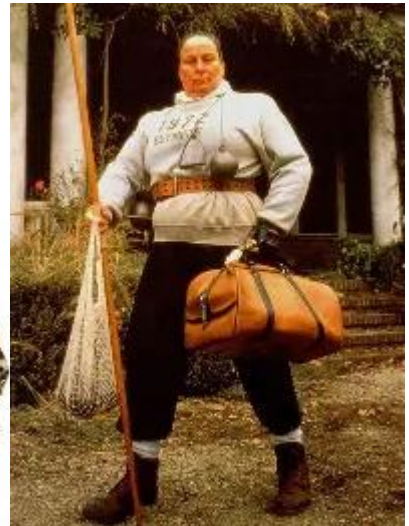
Escapologist and Acrobat